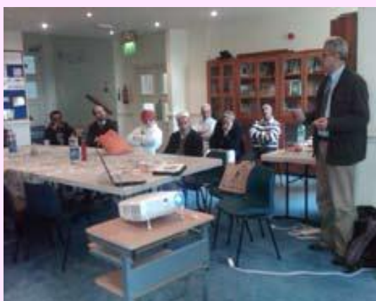
Abraham, Father of the Faiths at Stoke Poges Lane Mosque discussion