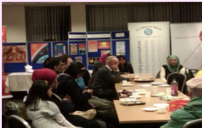
Renaissance Readers discussion