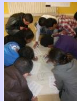
Anti Bullying Week workshop

Therefore we used worksheets, video, guest speakers and practical workshops as well as a Cathedral Visit.