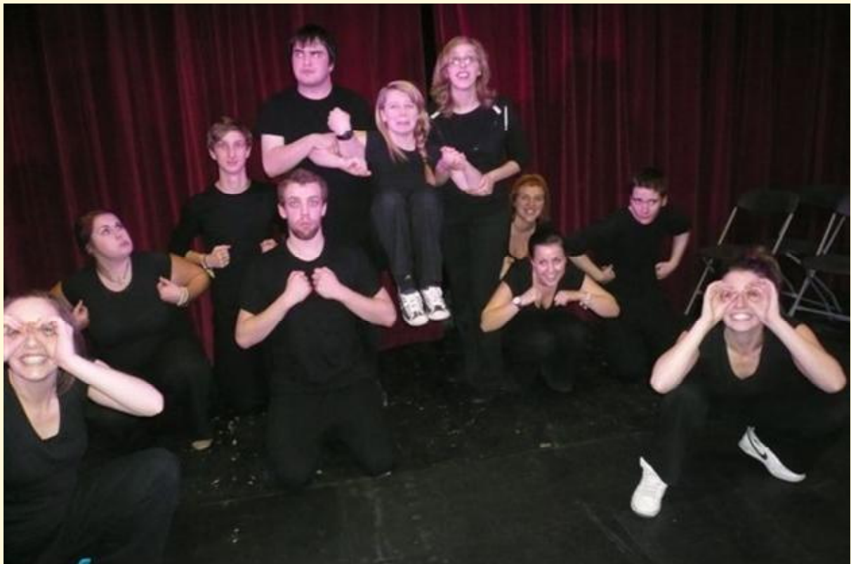
The Talented Young Cast of 'Peer Productions' presenting 'Inter Faith Matters'

The production was excellent: creative, amusing and thought provoking. The professionalism of the young cast was outstanding. One participant commented 'Brilliant, I thought the drama and discussion was thought-provoking and valuable. On top it is great to hear the actors were challenged through working with this material, and they too wrestled with the issues in their production.' Another said 'Drama was a most effective vehicle for highlighting ideas and issues and opening up communications'.