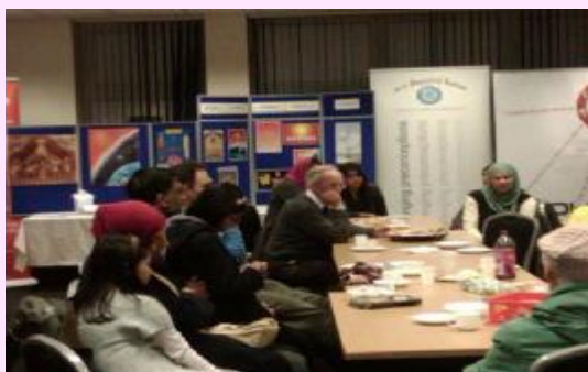
Renaissance Readers discussion