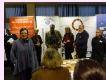
Fiona Mactaggart, MP for Slough, at the opening event