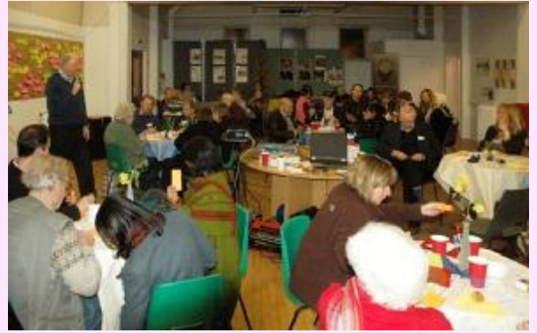
Faith Café Plenary

Link: www.bucksinfo.net/bucks-forum-of-faiths